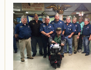
Giving mobility back to a deserving veteran provided by Sons from Florida

Across the country sons are serving veterans by assisting with home maintenance, driving VETERANS to VA centers, providing clothing, blankets, personal items and gifts to veterans residing in nursing and veterans homes. And each year scholarships are awarded at the local, state and national levels to assist students with their education.