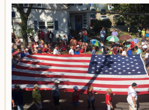
Sons from Ohio Sq 22 and AMVETS Family parade the 20 x40 US Flag before tens of thousands.

A Sons of AMVETS Squadron will allow your Post to increase its membership and presence in your community. It will allow more members of your family to become members of the AMVETS family. The Sons will add a new vitality to your Post's activities; and add many more new activities to what your post has to offer its membership.