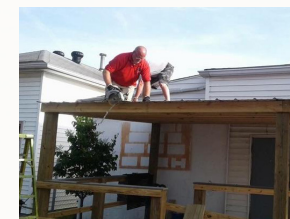
Kentucky Sq1 build a ramp and covered porch at the AMVETS Post.