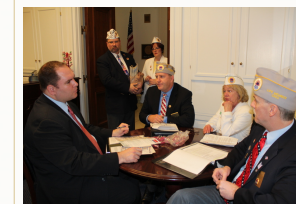
Legislative Committee from Ohio & Illinois at work for Veteran benefits.