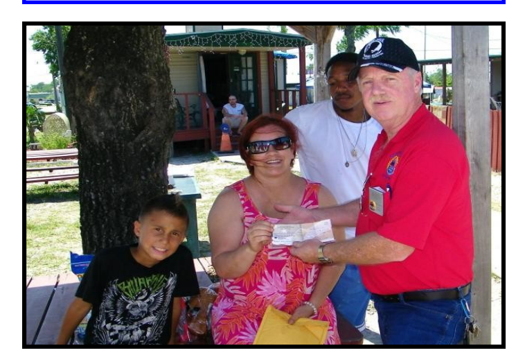
The Sons of AMVETS from Squadron 98, Holiday, FL presenting a check for funds raised for a homeless veterans shelter.

-Abraham Lincoln, 16<sup>th</sup> President of the United States of America, 2nd Inaugural Address