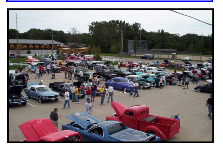
The Sons of AMVETS at Cedar Falls, IA 49 host their Annual Car show to raise money for their annual programs.

We are a subordinate organization of the AMVETS. We have been a part of the AMVETS Family since the first Squadron was formed at AMVETS Post 22 in Vermilion, OH in 1974.