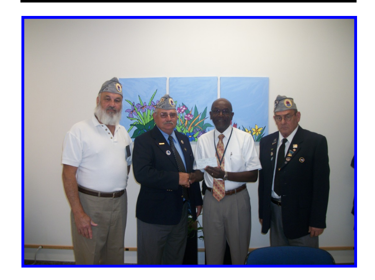
The Sons of AMVETS in North Carolina presenting a check for funds to a VA Hospital. Funds were donated as part of Sweats for Vets .

A Squadron can be formed with as few as eight eligible members. Also, a Department can be formed with as few as three Squadrons.