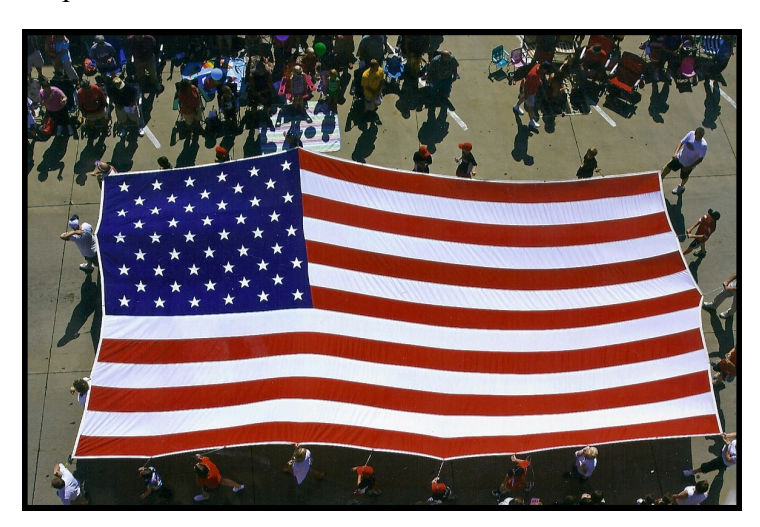
The Sons of AMVETS at Iowa 49 show their Spirit of Americanism by marching with an 18' by 38' American Flag in the Sturgis Fall Parade.

The largest Squadron in the country in 2010 was Sandusky, OH with 482 members.