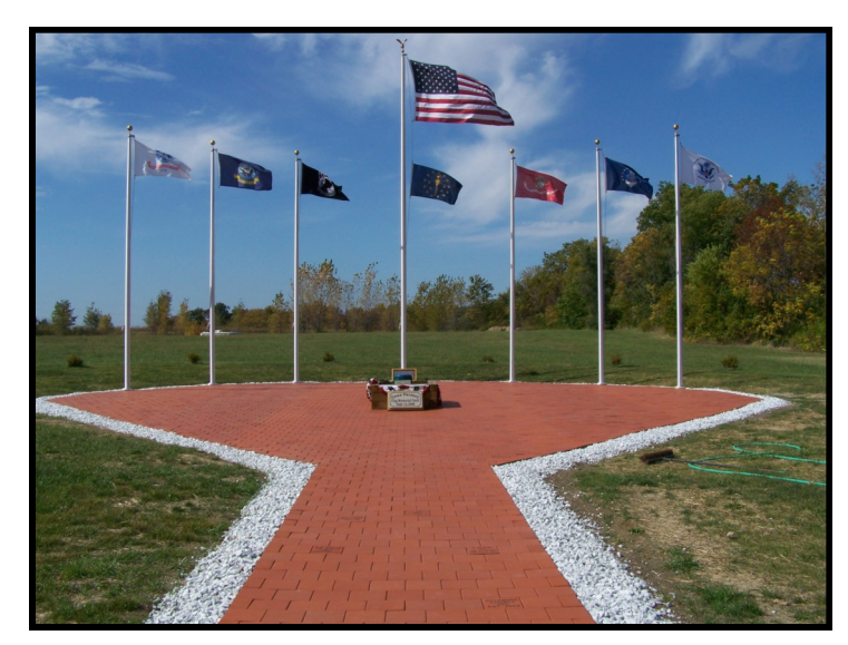
Squadrons often spend their funds to upgrade their Posts. Here, the Sons at Squadron 12 built a memorial park at their Post in Muncie, IN. They also host a Flag Retirement Ceremony annually, and recently retired their 10,000<sup>th</sup> flag.