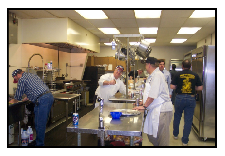
The Sons of AMVETS work hard at a local fundraiser at AMVETS Post 89 in Columbus, Ohio.

-Calvin Coolidge, President of the United States