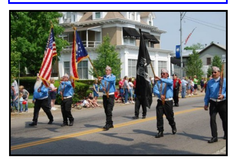
A Sons of AMVETS Honor Guard in Ohio marching in a local parade.

The Sons of AMVETS sponsor various community service projects. These include Americanism, VAVS, legislative, scholarship, food drives and many other programs. In addition, the Sons support AMVETS, Ladies Auxiliary and Junior AMVETS programs as well as other Veterans Service Organizations.