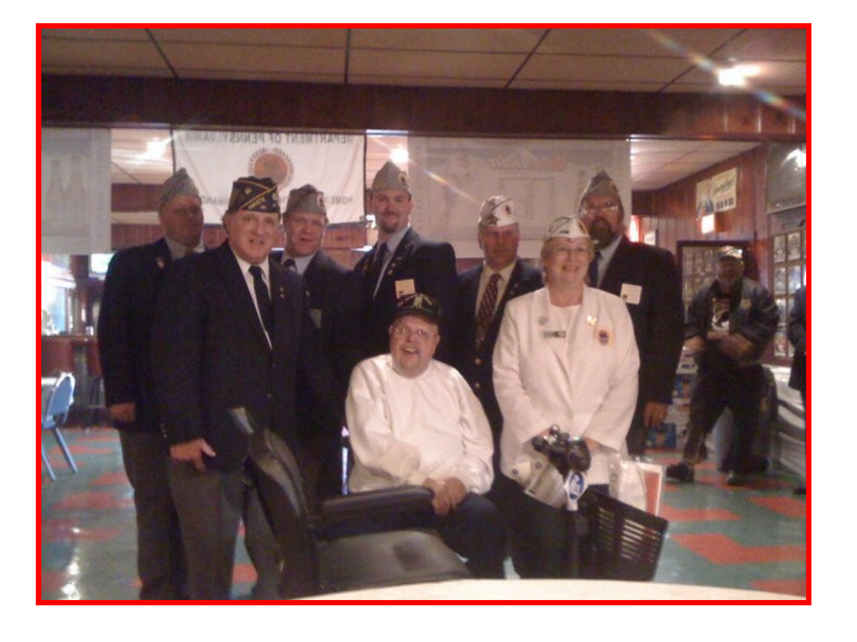
The Sons of AMVETS , Department of Pennsylvania delivering their 12th Scooter to a veteran in need.

At the State and National level, we meet when the AMVETS meet for SEC, NEC and Conventions. At the local level, we meet at least once every other month.