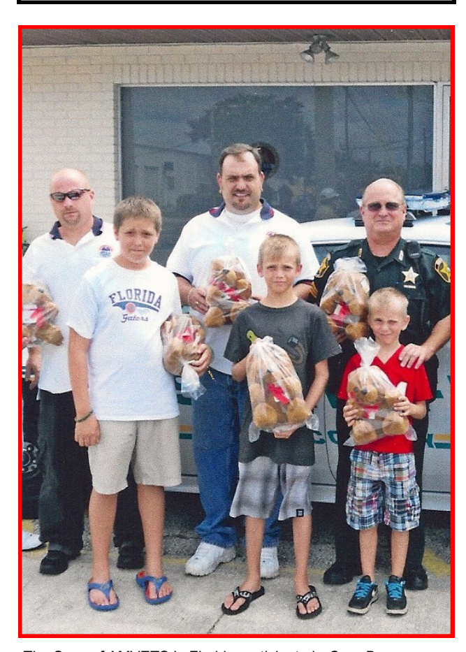
The Sons of AMVETS in Florida participate in Care Bears , which donates stuffed animals to Law Enforcement Agencies, which they distribute to children who have been traumatized by crime.

Eligibility for the Sons of AMVETS includes the sons, grandsons, adopted sons, stepsons, fathers, grandfathers, husbands and brothers of members of AMVETS and deceased members of AMVETS, or service personnel who died but would have been eligible for membership in AMVETS. Prospective members must be at least eighteen (18) years of age and not eligible for membership in AMVETS. This does not include in-laws of any type.